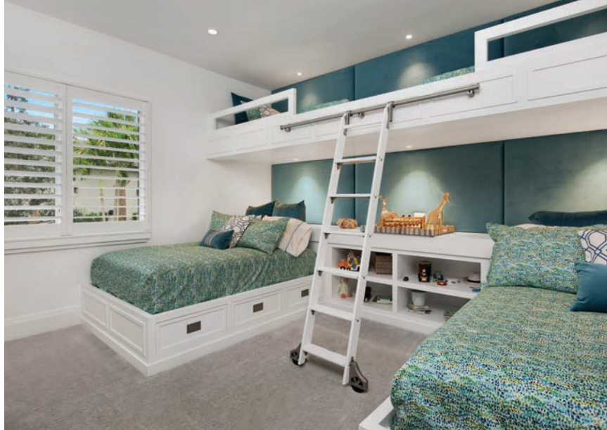
FIRE URNS ACCENT THE INFINITY POOL, ADDING DRAMATIC FLAIR TO THE OUTDOOR ENTERTAINING AREA. THE CHILDREN'S GUEST ROOM (ABOVE) BOASTS A LOFT-STYLE BED THAT BRINGS A COOL, PLAYFUL AESTHETIC TO THE SPACE.

lampakanai rope ottomans. Yet another guest room captures a more serene vision through details like a nightstand with a hand-painted finish that resembles Herrera marble and high-gloss, urn-like white lamps.