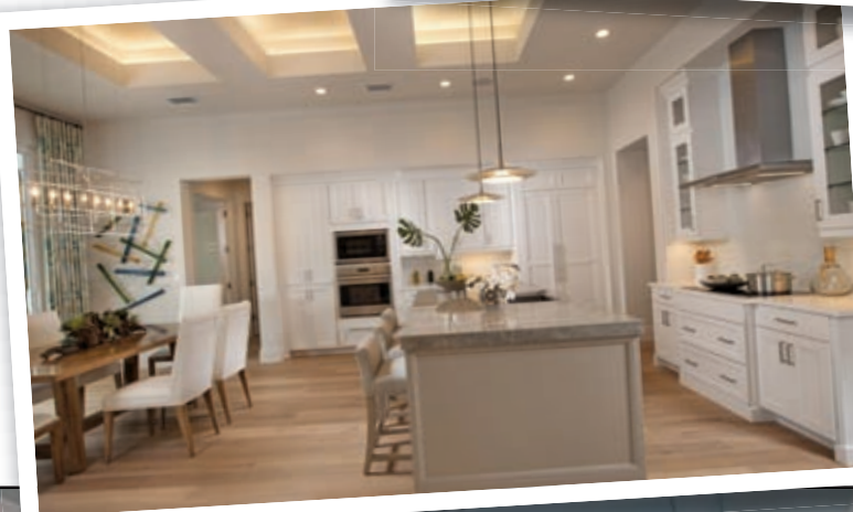
Left: The illuminated coffered ceiling in the eat-in kitchen adds yet another textured element and helps anchor kitchen island and dining space.