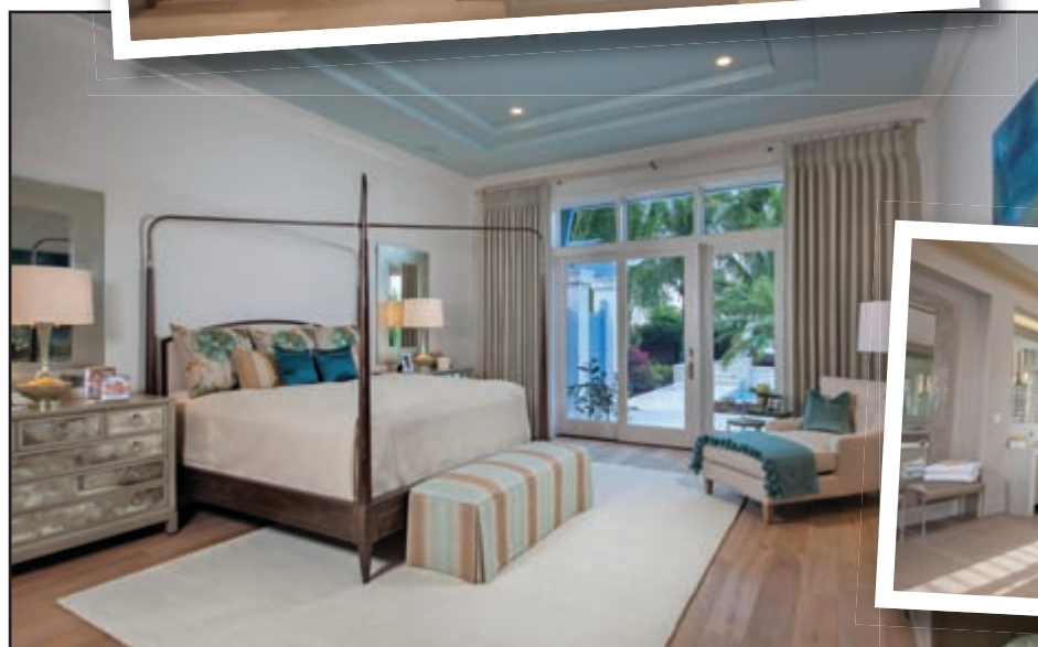
Below: The expansive master suite opens onto the resort-like pool area and features an en suite with a free-standing Kohler Stargazer tub under a floating backlit ceiling.