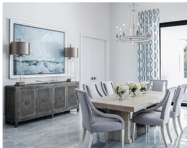
LUXE FABRICS, TEXTURED FURNITURE, AND GLAMOROUS LIGHT FIXTURES BRING THE HOME TO LIFE, CREATING DEPTH AND SOPHISTICATION WITHOUT OVERWHELMING THE SPACE.

After 20 years of visiting family in Naples, a Pennsylvania couple decided it was time to find a winter escape of their own. They discovered the exclusive neighborhood of Cambridge Park at Orange Blossom, an enclave of 17 estate homes developed and built by London Bay. Within proximity to beaches, upscale shopping, and fine dining, it was the perfect location for a family that includes two daughters.