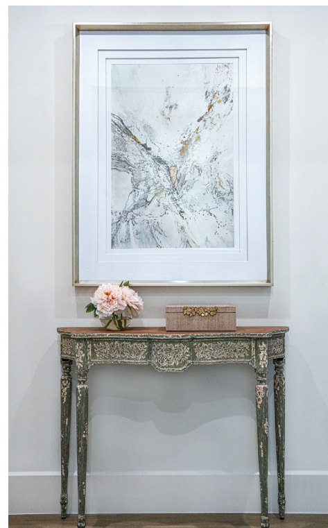
ABOVE: PIECES WITH CHARACTER AND HISTORY ADD A TOUCH OF ELEGANCE TO THE HOME.