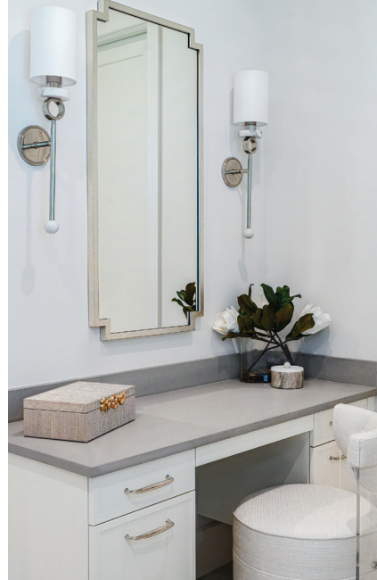
FAR RIGHT: THE BUILT-IN DROP STATION OFFERS A FUNCTIONAL AND STYLISH STORAGE SOLUTION.