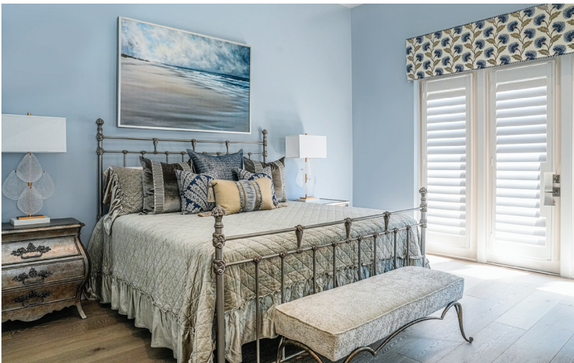
ABOVE: A GUEST ROOM IN SOOTHING SHADES OF BLUE DOES NOT DEPART FROM THE HOME'S OVERALL AESTHETIC.